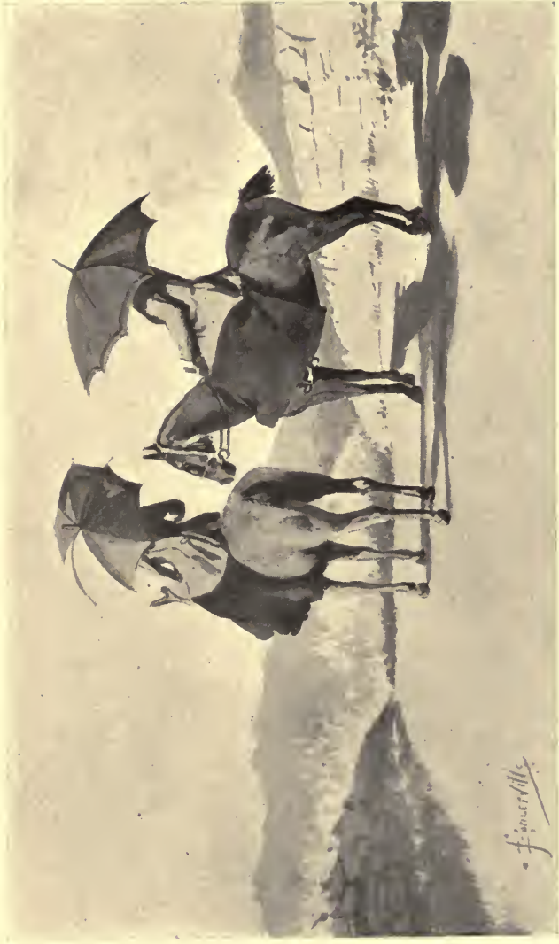
"The parapet of the wooded precipice, from whose edge we were looking back."